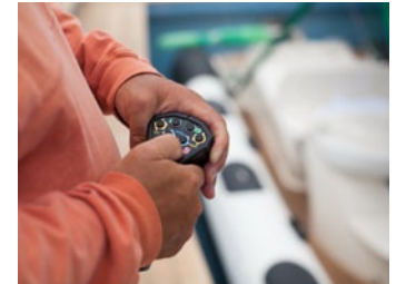
Easy to use proportional controls on all cranes above 1500 lbs (680 kg)