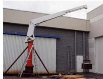
Cranes are proof tested to 110% of capacity