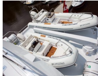
Compact design uses less deck space