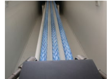
Whisper quiet linear winches use composite rope which is quieter and stronger than steel cable